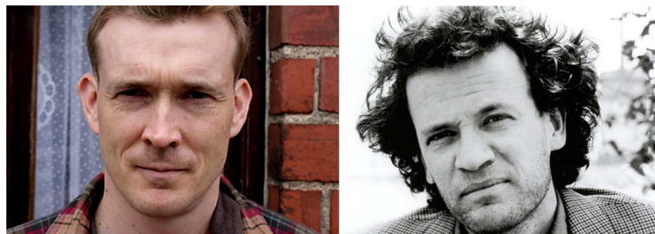
David Mitchell, Yann Martel.

20 under 40 list. And David Grossman is one of Israel's most distinguished authors.