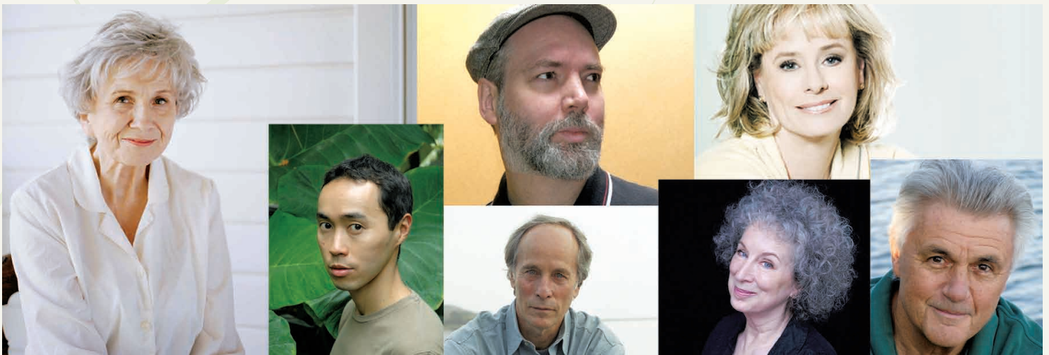
From left: Alice Munro, Tash Aw, Douglas Coupland, Richard Ford, Kathy Reichs, Margaret Atwood, John Irving.

Check out the newest information at www.writersfest.bc.ca